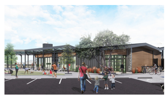
Caption: A new café and retailer will also be situated at the entrance to Wooing Tree Estate.